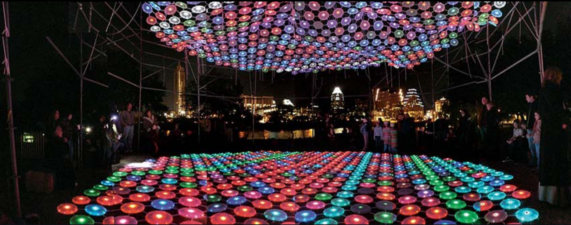
Light Installation: Legge Lewis Legge architects, Ultimate Pulse , 2009, Austin Texas.