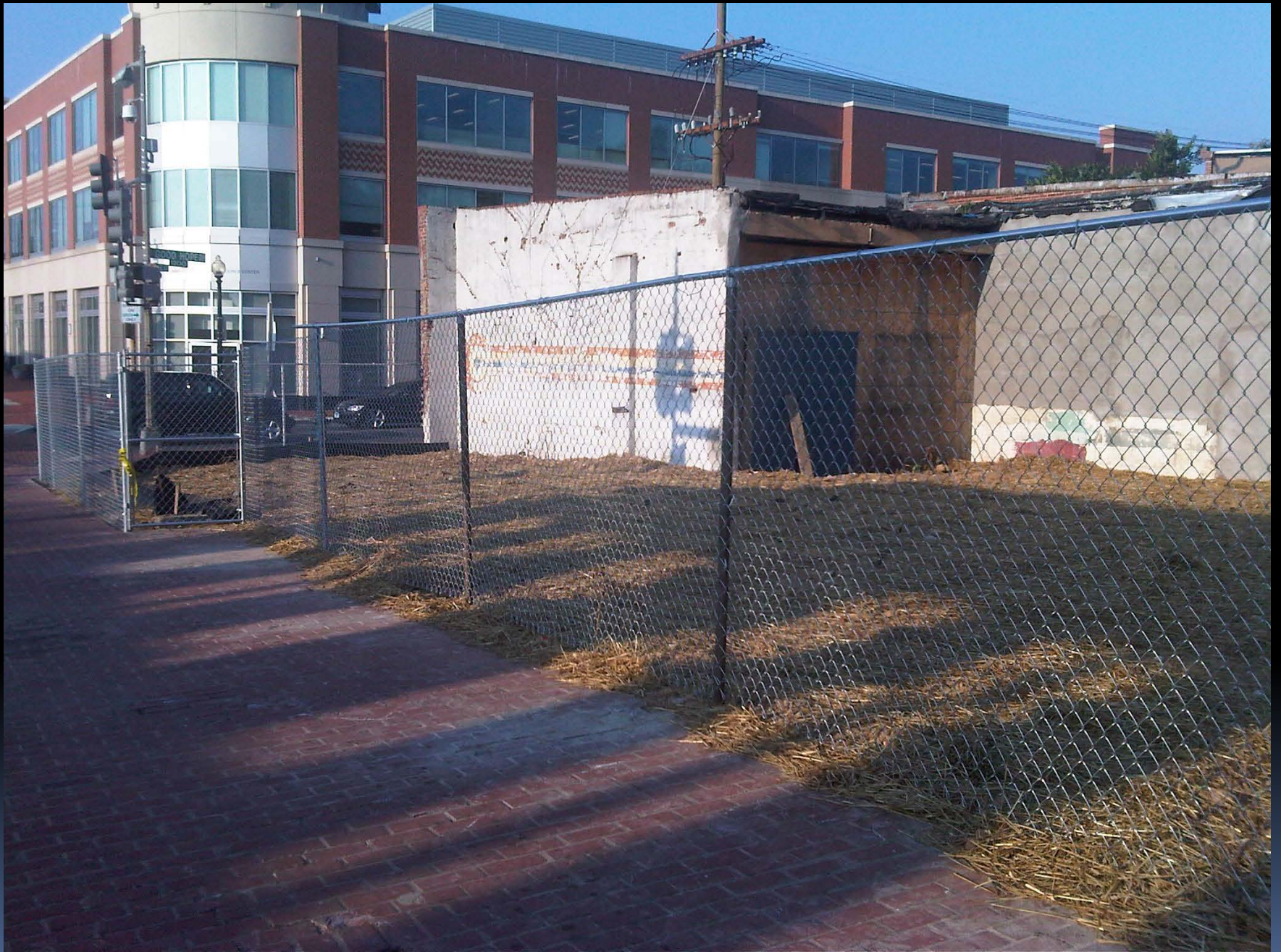
The Site: 1201 Good Hope Road, SE