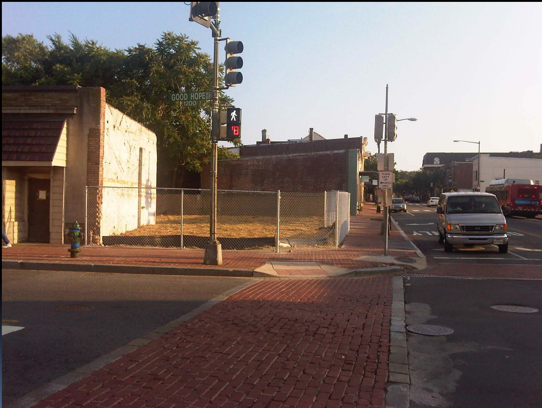
The Site: 1201 Good Hope Road, SE