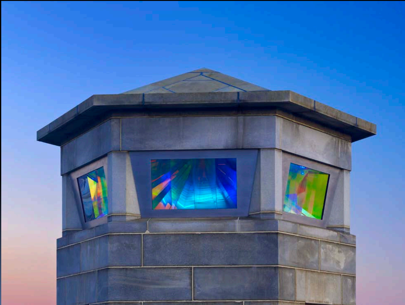
Light Installation: Mikyoung Kim, Kaleidoscope 2010, 14 th Street Bridge Tenders House, SW.